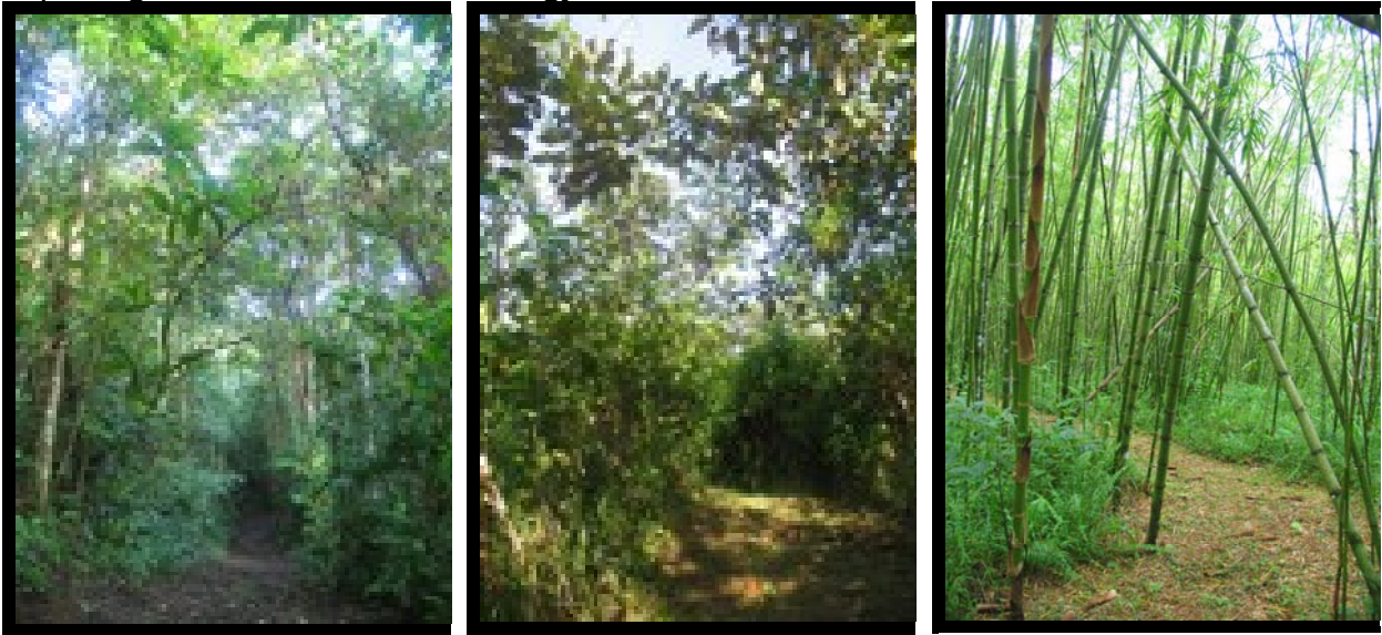
FIGURE 1. The three habitats of study on the Firestone Reserve, Costa Rica: selectively-logged riparian forest (left), post-pasture secondary forest (center) and non-native bamboo plantation (right).